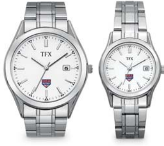
1931254 Men's Silver TFX by Bulova Watch. Printed USA Softball logo on dial. $58.00