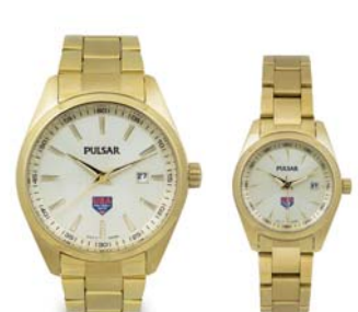
1970602 Men's Gold Pulsar. Printed USA Umpire on dial. $95.00