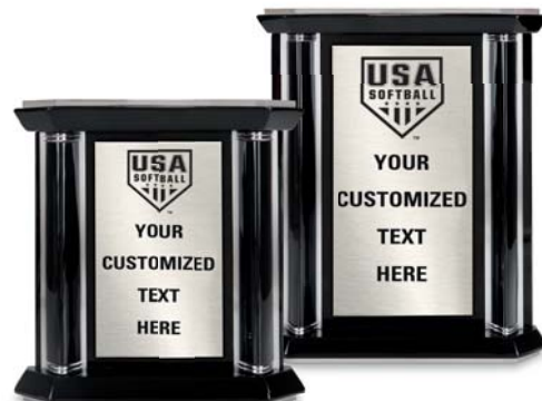
AS730016 14" Black Pianowood Column Plaque. USA Softball logo at top, customized text below. $99.00