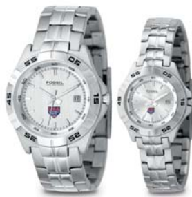
1970595 Men's Silver Fossil Watch. Printed USA Umpire logo on dial. $98.00