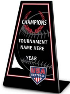
AS1602 10" black acrylic upright award. USA Softball logo and customized text on front. $18.00