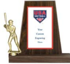
AS8513 16" wall of honor award. Large softball figurine on walnut finish base with USA Softball logo and customized text on plate. $45.00