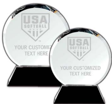
AS720020 8.5" Optic Crystal Circle. USA Softball logo at top, customized text below. $57.00 AS720021 6.75" Optic Crystal Circle. USA Softball logo at top, customized text below. $40.00