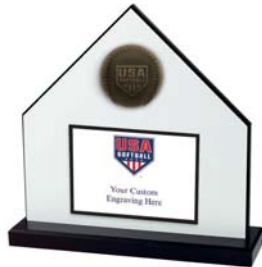
AS8622 14" white home plate award with a 1/2 resin cast USA Softball and customized text on plate. $63.00