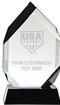
AS720002 9.5" Optic Crystal Royal Diamond, USA Softball logo at top, customized text below. $85.00