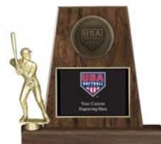
AS8523 16" prestige award. Large softball figurine on walnut finish base with a 1/2 resin cast USA Softball and customized text on plate. $55.00