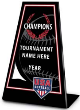
AS1601 12" black acrylic upright award. USA Softball logo and customized text on front. $20.00