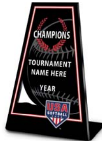
AS1603 8" black acrylic upright award. USA Softball logo and customized text on front. $16.00