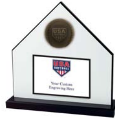
AS8623 12" white home plate award with a 1/2 resin cast USA Softball and customized text on plate. $58.00