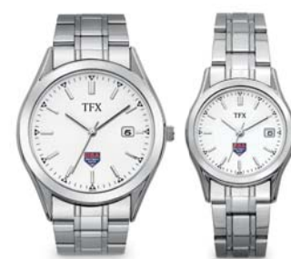
1970597 Men's Silver TFX by Bulova Watch. Printed USA Umpire logo on dial. $58.00