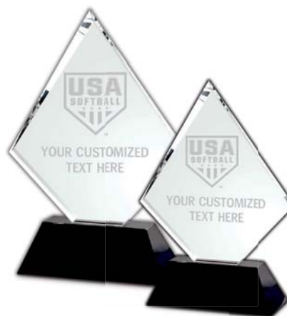
AS720022 10" Optic Crystal Diamond. USA Softball logo at top, customized text below. $57.00 AS720023 8" Optic Crystal Diamond. USA Softball logo at top, customized text below. $40.00