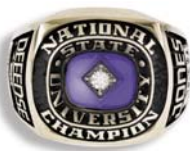
AS771D Male, tube set stone, double bevel