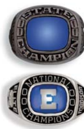
AS7923 Female / Youth (with encrusting) single bevel

Specify stock side design for custom series by name.