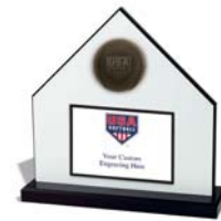
AS8624 10" white home plate award with a 1/2 resin cast USA Softball and customized text on plate. $53.00