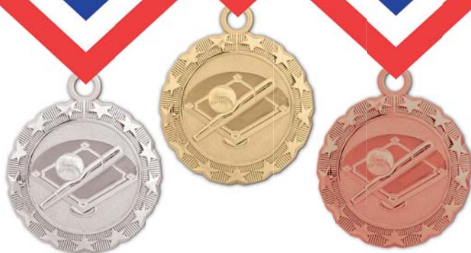
SOFT-G(gold), SOFT-S(silver), SOFT-B(bronze) 2 3/8" Softball Medallion with 3/4"x1 1/2" Red, White & Blue Neck Ribbon. (Available in gold silver and bronze) $3.50