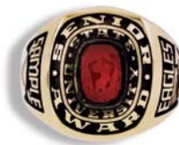
AS772D Male, plain stone double bevel