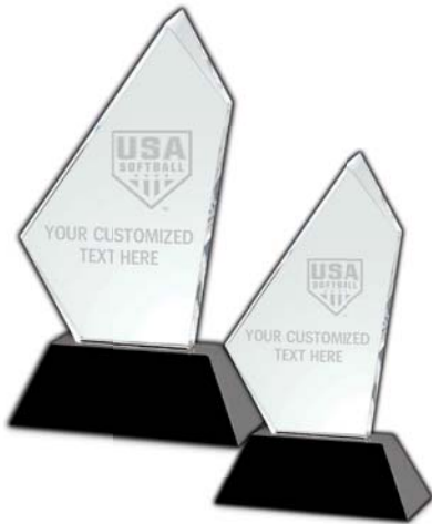
AS720024 10" Optic Crystal Abstract. USA Softball logo at top, customized text below. $57.00