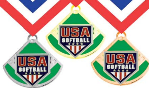
USA-G (gold), USA-S(silver), USA-B(bronze) 3" USA Softball Gold Medallion w/ 3/4"x1 1/2" Red, White & Blue Neck Ribbon. (Available in gold silver and bronze) $5.50