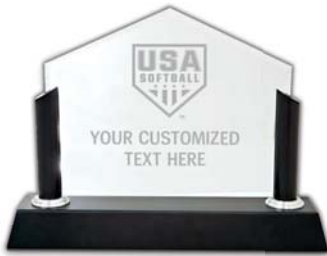
AS710015 9.75" Glass Peak Award. USA Softball logo at top, customized text below. $72.00