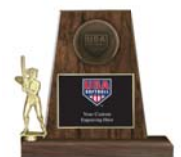
AS8524 14" prestige award. Softball figurine on walnut finish base with a 1/2 resin cast USA Softball and customized text on plate. $53.00