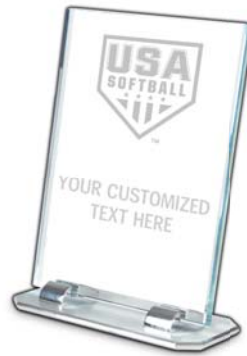
AS760030 8" Tilt Glass Award. USA Softball logo at top, customized text below. $39.00