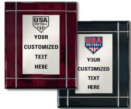
AS760026 12" Red Pianowood Executive Plaque. USA Softball logo at top, customized text below. $85.00