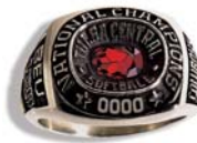
AS7923D1 Female / Youth double bevel