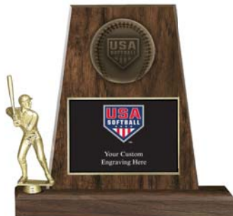
AS8521 20" prestige award. Large softball figurine on walnut finish base with a 1/2 resin cast USA Softball and customized text on plate. $61.00