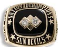
AS771D2 Male, tube set stone, single bevel.