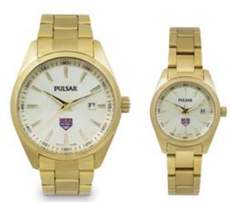
1931258 Men's Gold Pulsar. Printed USA Softball on dial. $95.00