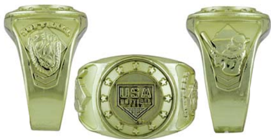
RING-G Gold, Size 8, Souvenir Ring. $10.00