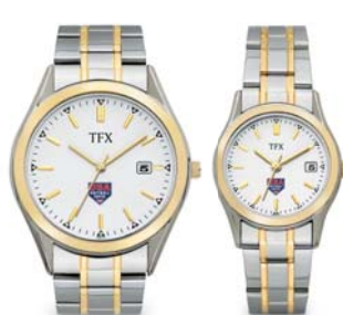
1970600 Men's Two-tone TFX by Bulova Watch. Printed USA Umpire logo on dial. $48.00