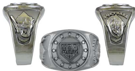
RING-S Silver, Size 8, Souvenir Ring. $10.00