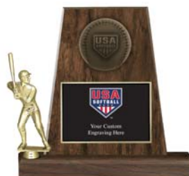
AS8522 18" prestige award. Large softball figurine on walnut finish base with a 1/2 resin cast USA Softball and customized text on plate. $57.00