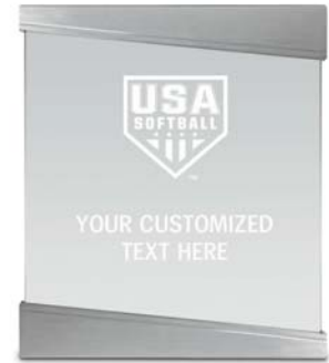
AS760031 9.5" Aluminum Accented Glass Plaque, USA Softball logo at top, customized text below. $55.00