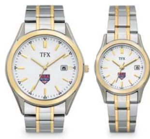
1931256 Men's Two-tone TFX by Bulova Watch. Printed USA Softball logo on dial. $48.00