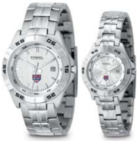
1931252 Men's Silver Fossil Watch. Printed USA Softball logo on dial. $98.00