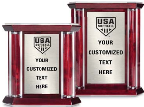
AS730011 14" Red Pianowood Column Plaque. USA Softball logo at top, customized text below. $99.00