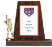
AS8514 14" wall of honor award. Softball figurine on walnut finish base with USA Softball logo and customized text on plate. $44.00