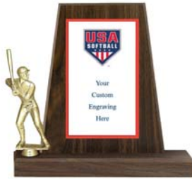
AS8512 18" wall of honor award. Large softball figurine on walnut finish base with USA Softball logo and customized text on plate. $47.00