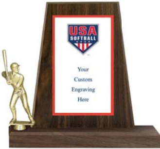
AS8511 20" wall of honor award. Large softball figurine on walnut finish base with USA Softball logo and customized text on plate. $50.00